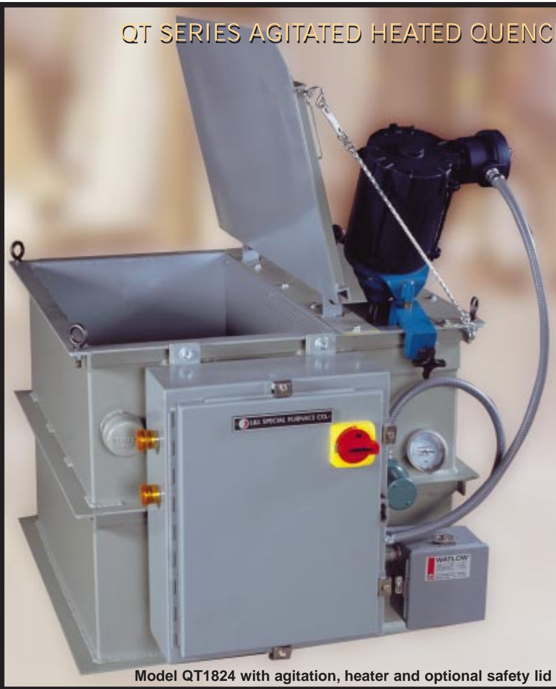
Model QT1824 with agitation, heater and optional safety lid