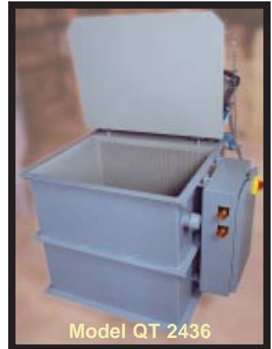
Model QT 2436