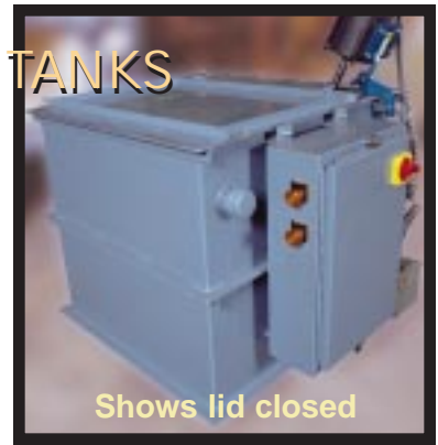
Shows lid closed